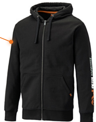
TB0 A4QT9-BK JET BLACK

The outer textile has a water, dirt and stain repellent. The moisture is absorbed on the inner textile and distributed over a large surface where it can evaporate, helping to keep you drier and more comfortable.