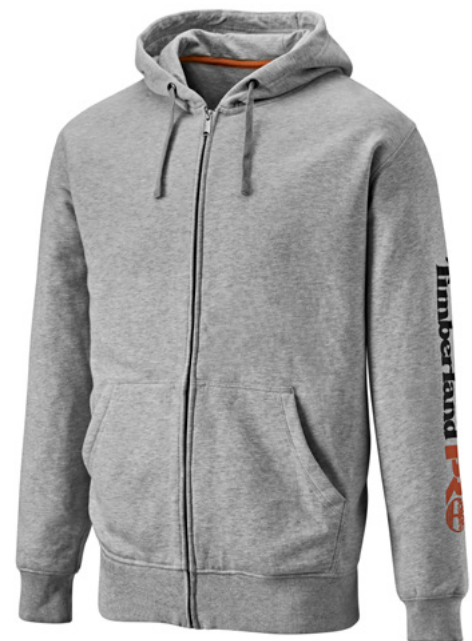
TB0 A4QT9-GYM MID GREY HEATHER