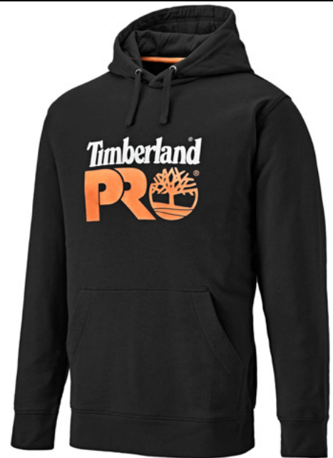
TB0 A4QT8-BK JET BLACK