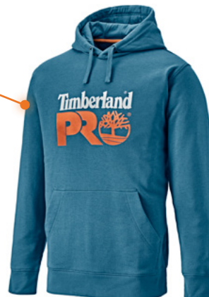
TB0 A4QT8-TEA TEAL BLUE

The outer textile has a water, dirt and stain repellent. The moisture is absorbed on the inner textile and distributed over a large surface where it can evaporate, helping to keep you drier and more comfortable.