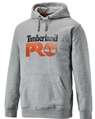
TB0 A4QT8-GYM MID GREY HEATHER