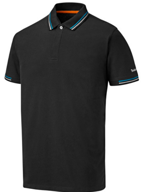
TB0 A4QT7-BK JET BLACK