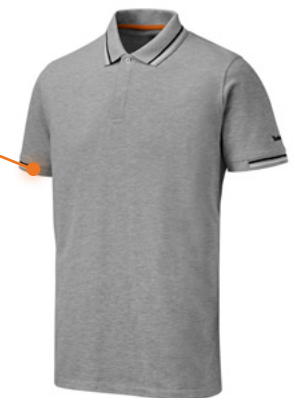
TB0 A4QT7-GYM MID GREY HEATHER

Timberland PRO® Wickwork® Technology forces the transfer of moisture away from the skin to the outside of the fabric where it can evaporate, helping to keep you drier and more comfortable.