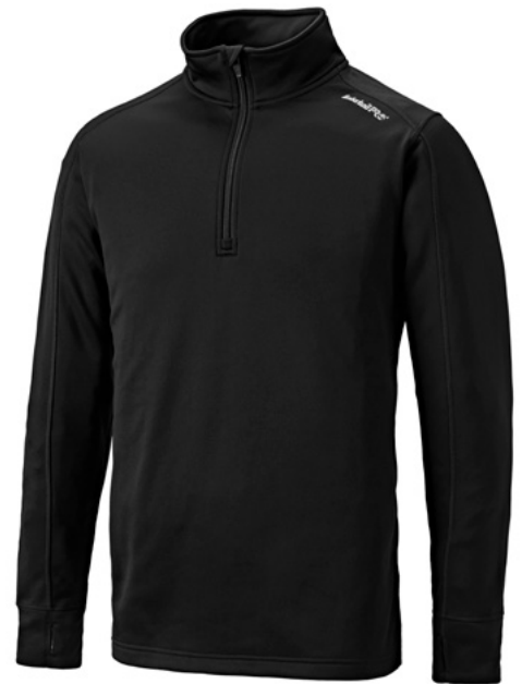
TB0 A4QT3-BK JET BLACK