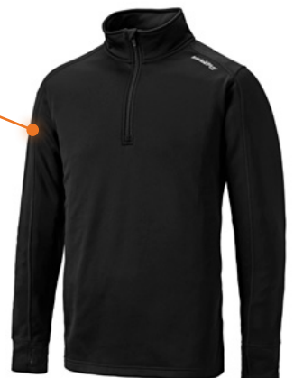
TB0 A4QT3-BK JET BLACK

The outer textile has a water, dirt and stain repellent. The moisture is absorbed on the inner textile and distributed over a large surface where it can evaporate, helping to keep you drier and more comfortable.