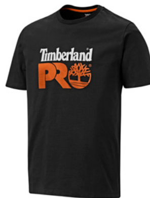
TB0 A4QT2-BK JET BLACK