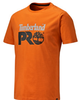
TB0 A4QT2-OR BURNT ORANGE