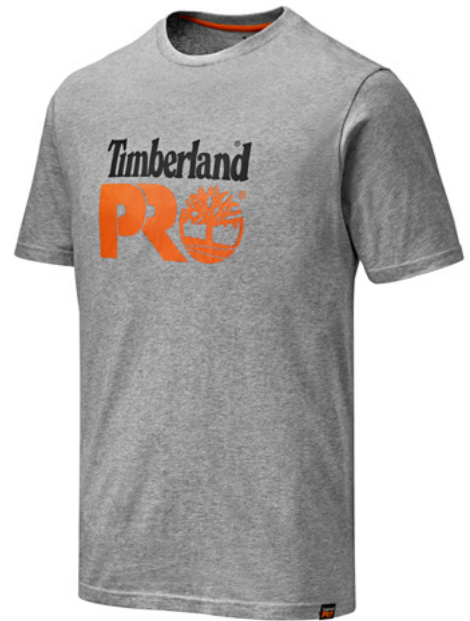
TB0 A4QT2-GYM MID GREY HEATHER