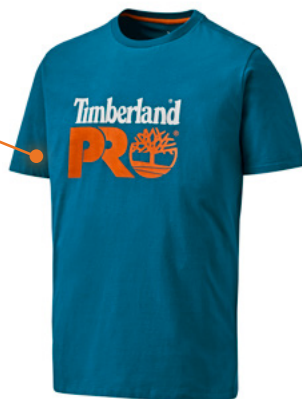
TB0 A4QT2-TEA TEAL BLUE

Timberland PRO® Wickwork® Technology forces the transfer of moisture away from the skin to the outside of the fabric where it can evaporate, helping to keep you drier and more comfortable.