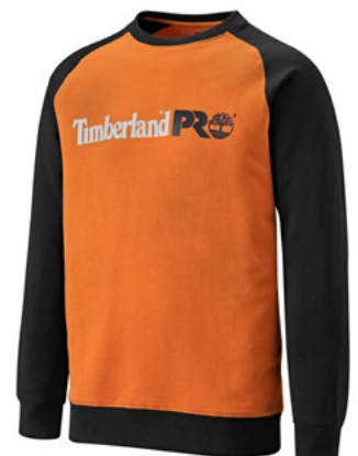
TB0 A23BA-OR BURNT ORANGE