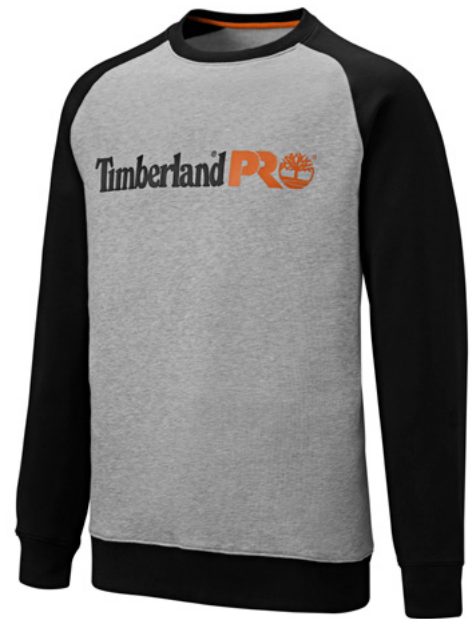
TB0 A23BA-GYM MID GREY HEATHER