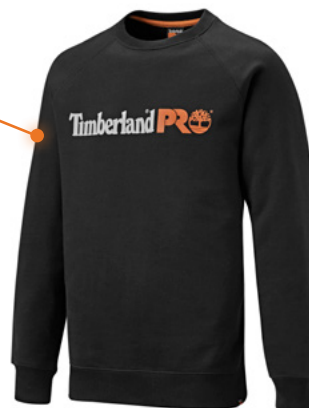
TB0 A23BA-BK JET BLACK

The outer textile has a water, dirt and stain repellent. The moisture is absorbed on the inner textile and distributed over a large surface where it can evaporate, helping to keep you drier and more comfortable.