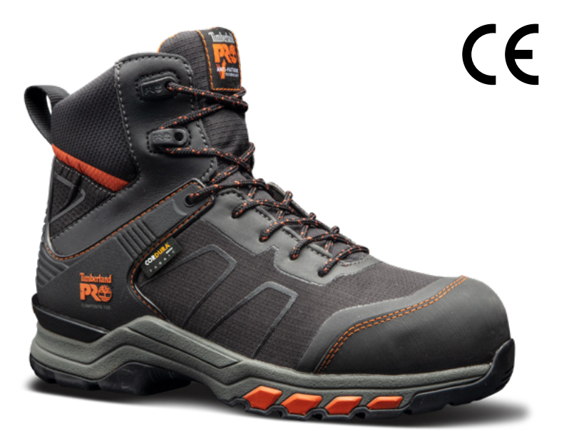
A1YV8 001 COMPOSITE SAFETY TOE Black