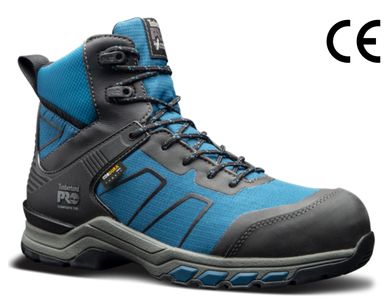
A1ZGC 001 COMPOSITE SAFETY TOE Teal